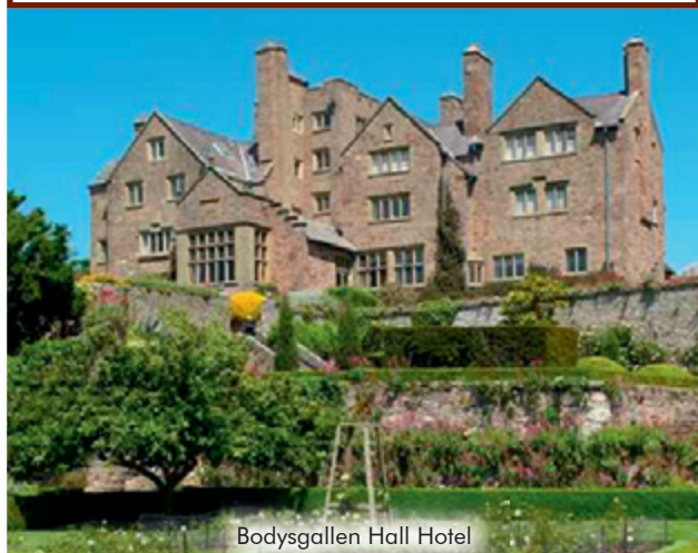
Bodysgallen Hall Hotel

It is a condition of booking that you arrange travel insurance to protect yourself against loss. In the unlikely event of cancellation by WFASC we undertake to refund you in full within 14 days all monies paid to us in course fees.