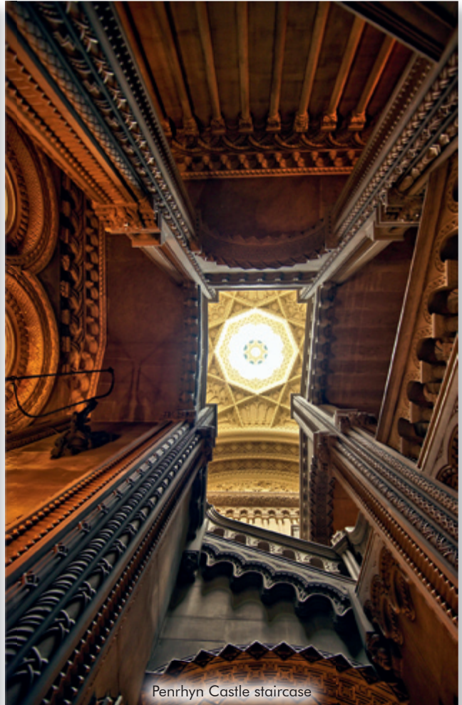
Penrhyn Castle staircase