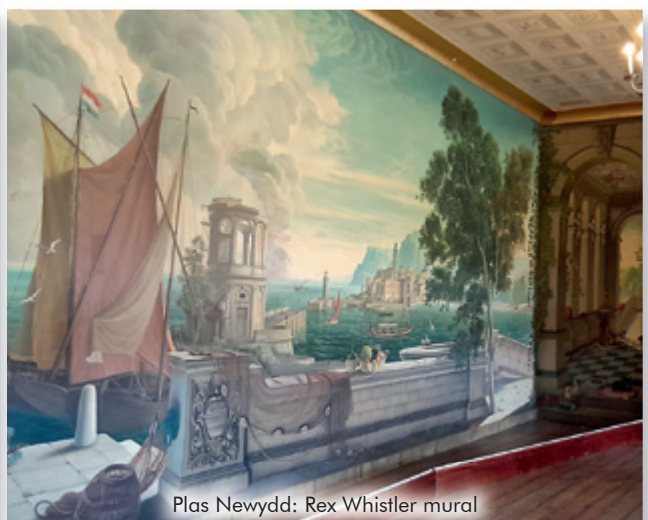
Plas Newydd: Rex Whistler mural